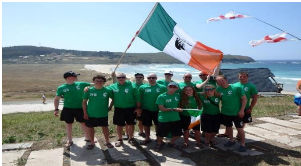
The Irish paddle Surf team before they hit the waves.