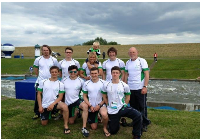
Picture of the Slalom Team at Krakow white water course.

Catch all the action at www.facebook.com/canoeliveresults?fref=nf