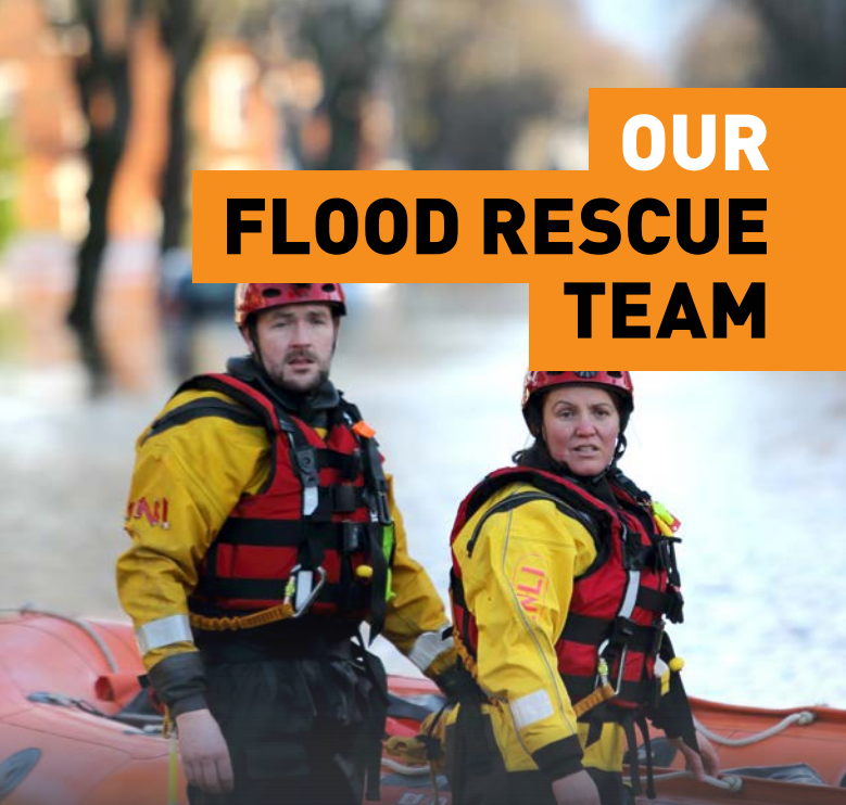
The RNLI's Flood Rescue Team is a group of volunteers and staff who are specially trained to carry out search and rescue operations in severe flooding situations throughout the UK and Ireland – and around the world.