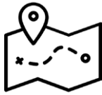
SHORE BASED TRIP PLANNING

There are 8 modules to be completed in this award.